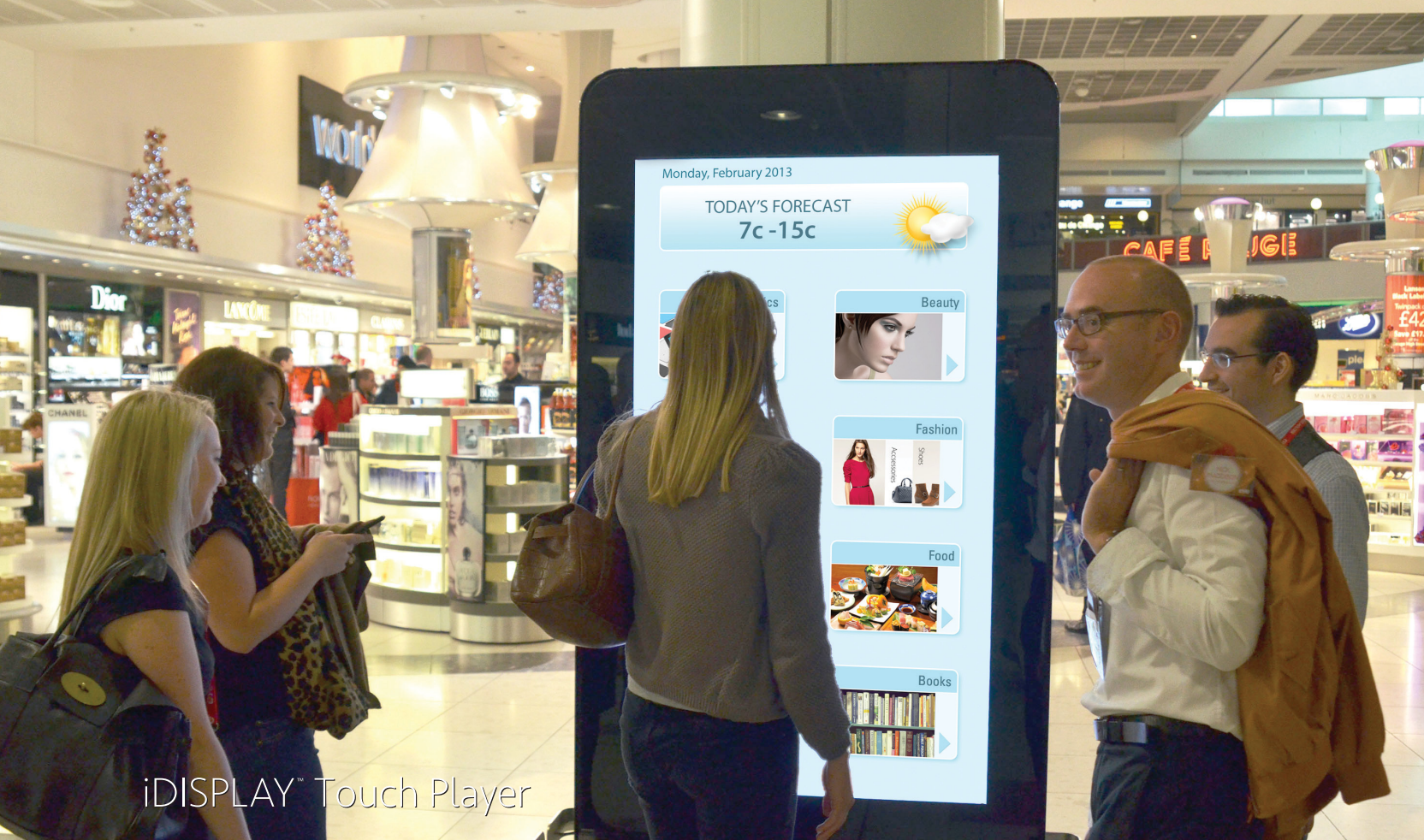
iDISPLAY™ Touch Player